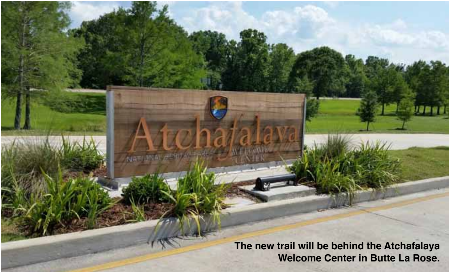
The new trail will be behind the Atchafalaya Welcome Center in Butte La Rose.

Construction is anticipated to begin in 2017.