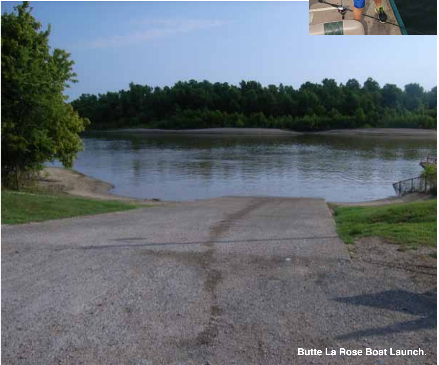
Butte La Rose Boat Launch.