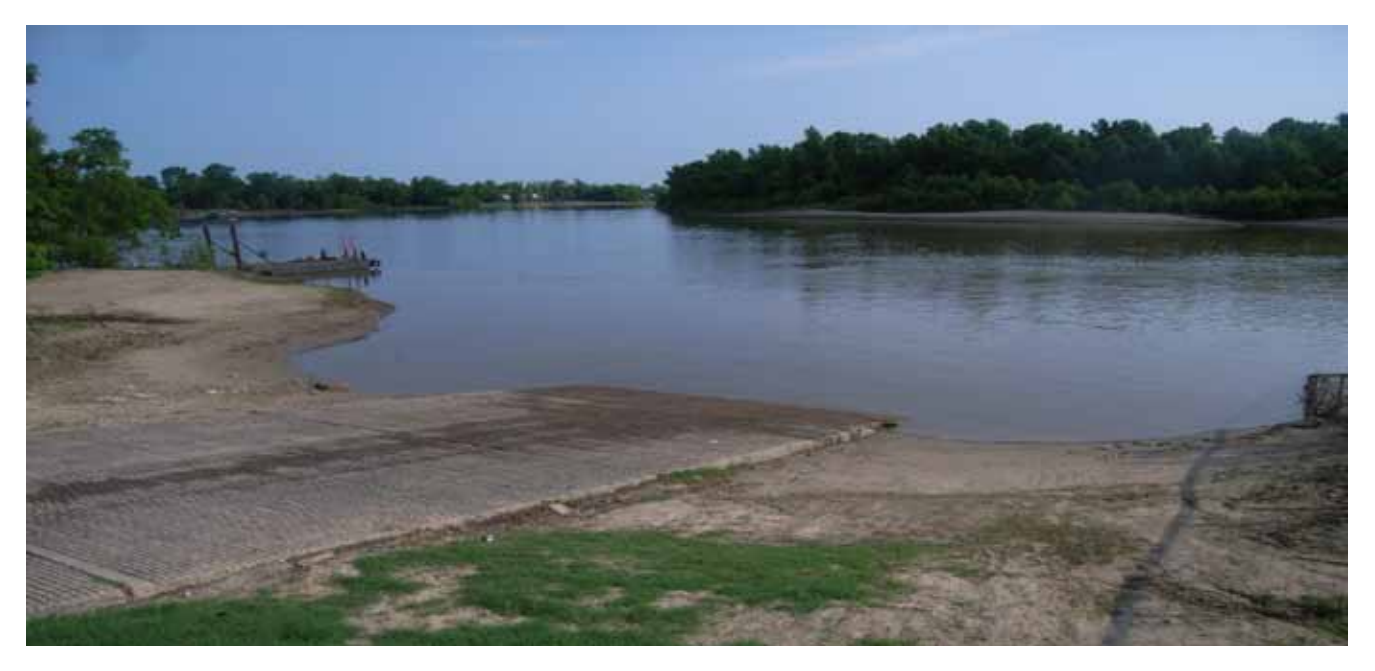
Butte La Rose Boat Launch

This project is anticipated to be completed in 2017.