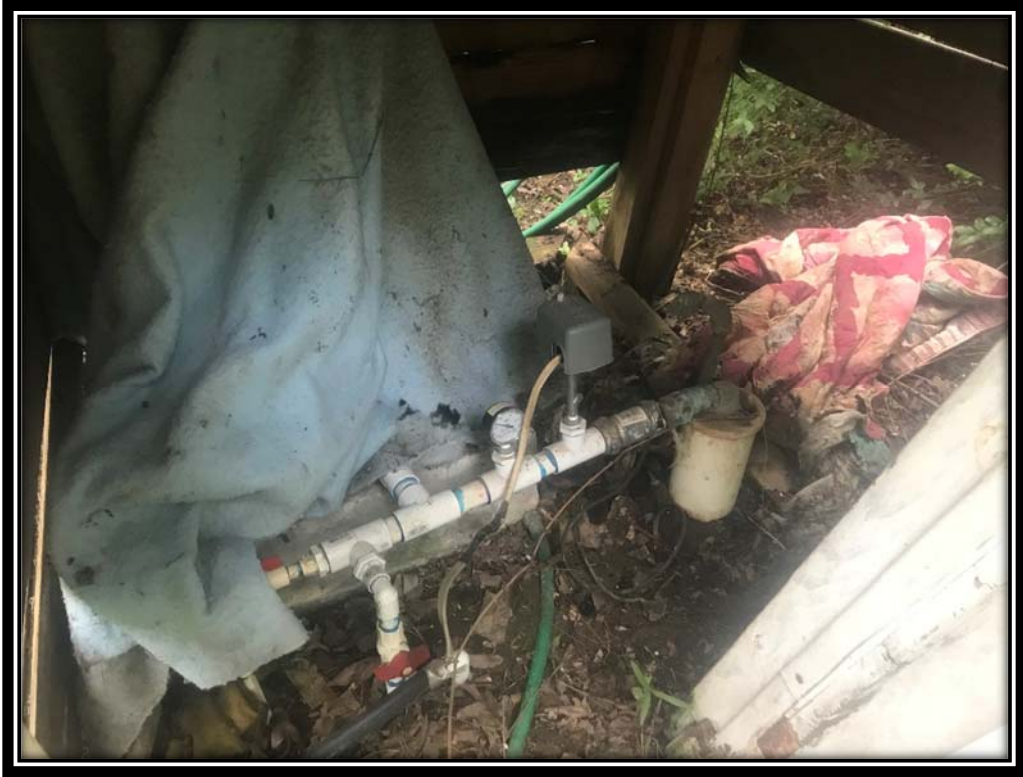
Leroy Smith-5124Z water well