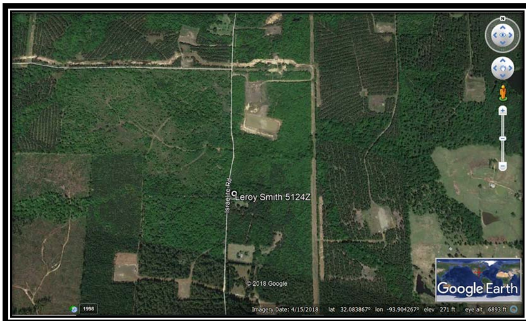
Zoomed out Google Earth Aerial Map of the Leroy Smith-5124Z water well