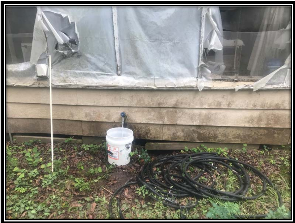
Faucet from which well was purged and sample collected