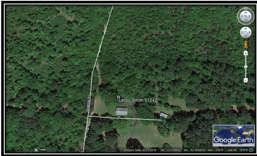
Zoomed in Google Earth Aerial Map of the Leroy Smith-5124Z water well