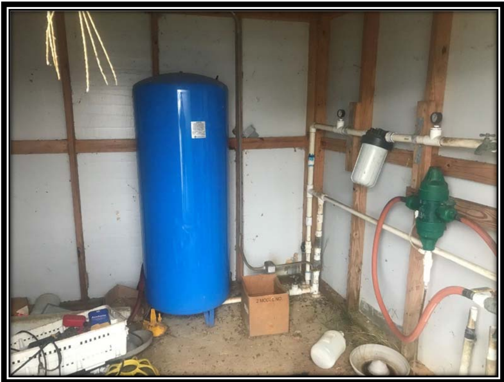
Blake Gamble-6729Z Water well Pump Shed