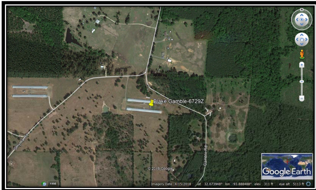
Zoomed out Google Earth Aerial Map of the Blake Gamble-6729Z water well