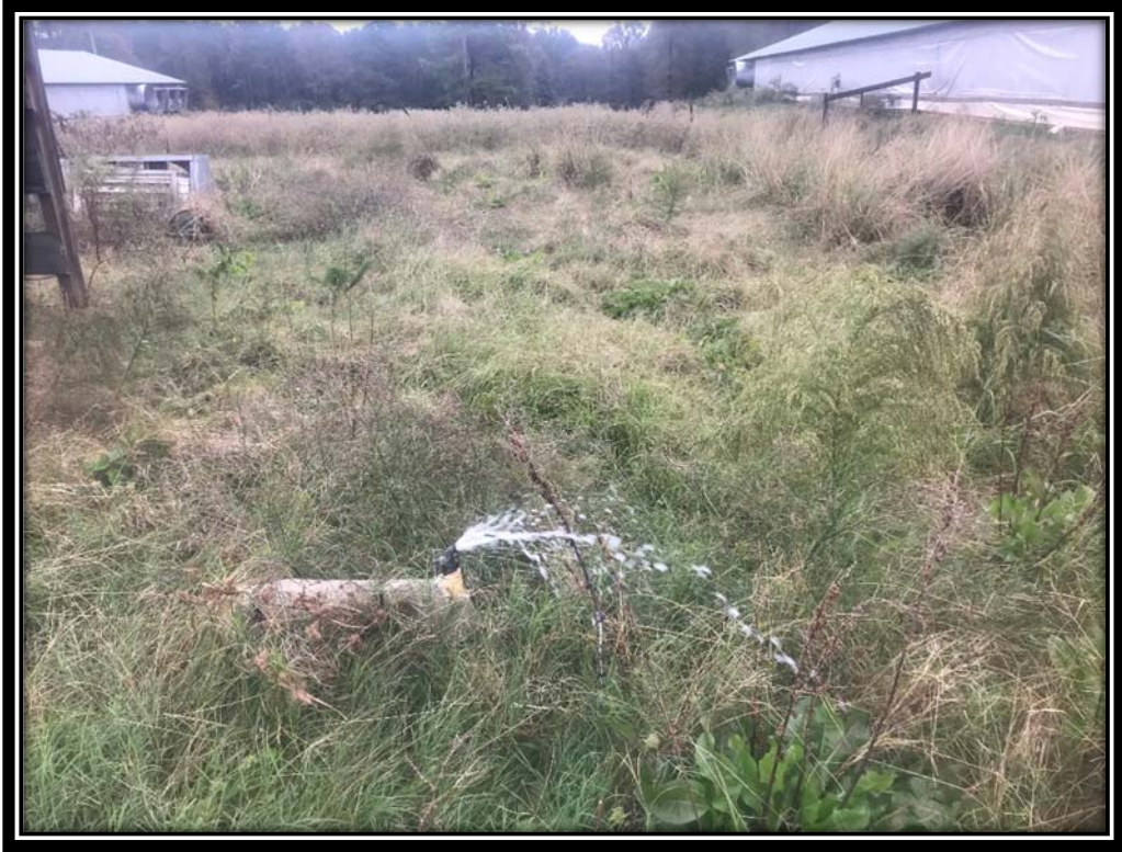
Blake Gamble-6729Z water well