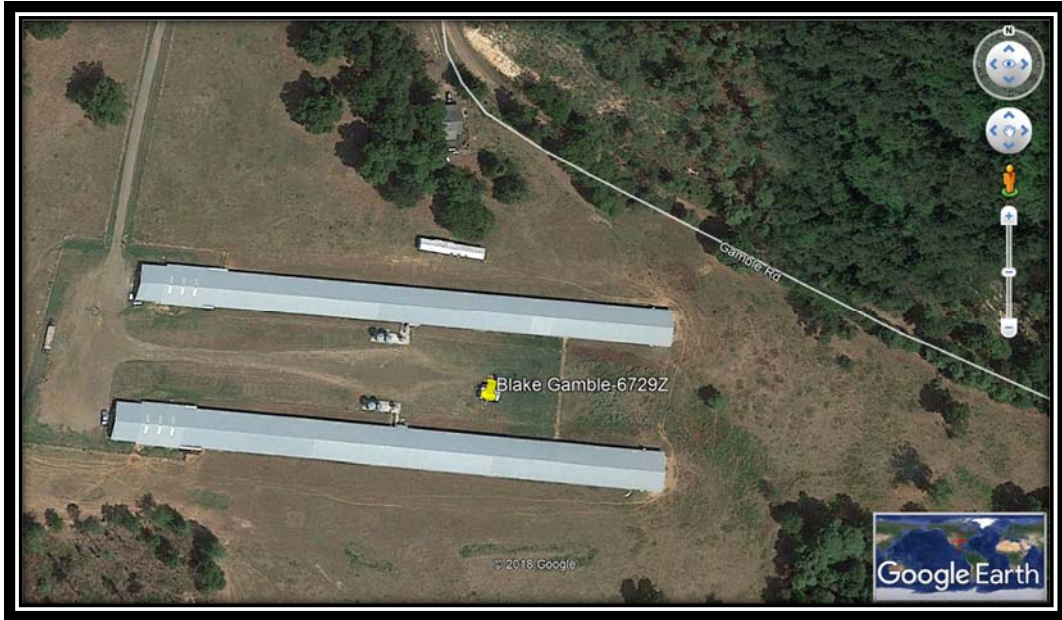
Zoomed in Google Earth Aerial Map of the Blake Gamble-6729Z water well