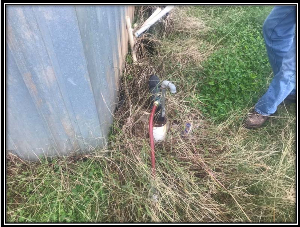
Herman Gamble-6576Z water well