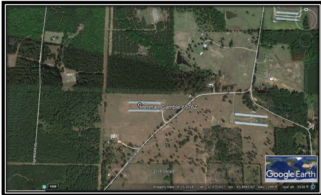
Zoomed out Google Earth Aerial Map of the Herman Gamble-6576Z water well