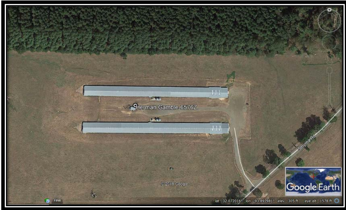
Zoomed in Google Earth Aerial Map of the Herman Gamble-6576Z water well