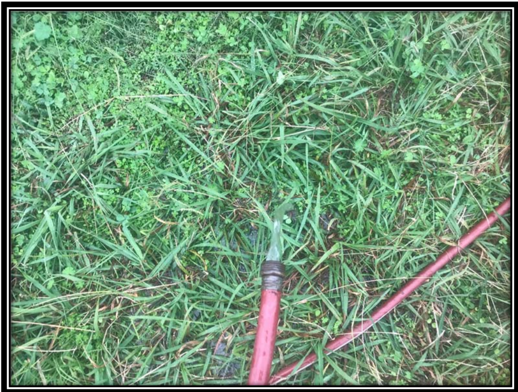
Herman Gamble-6576Z Water hose/Sample Collection Point