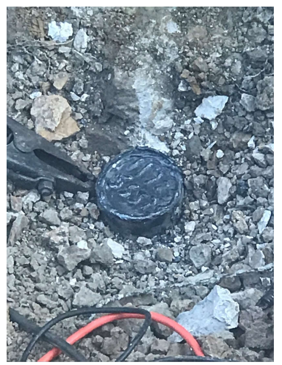
The Bell No. 001 (SN 55575) was permanently abandoned in Caddo Pine Island by Lemoine Disaster Recovery and local contractors.

Site Restoration operations are ongoing in both the Shreveport and Monroe districts. The