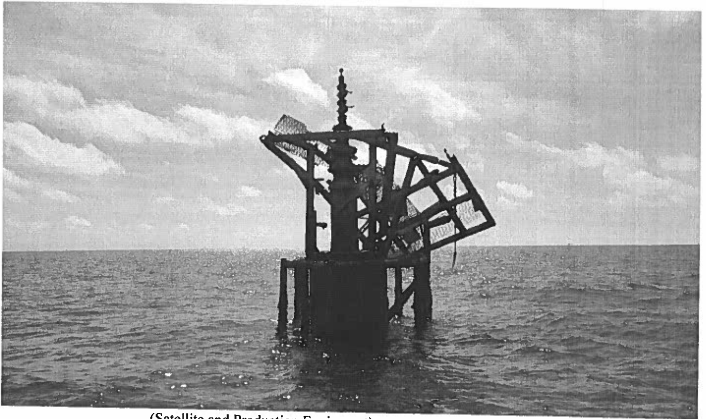
(Satellite and Production Equipment)