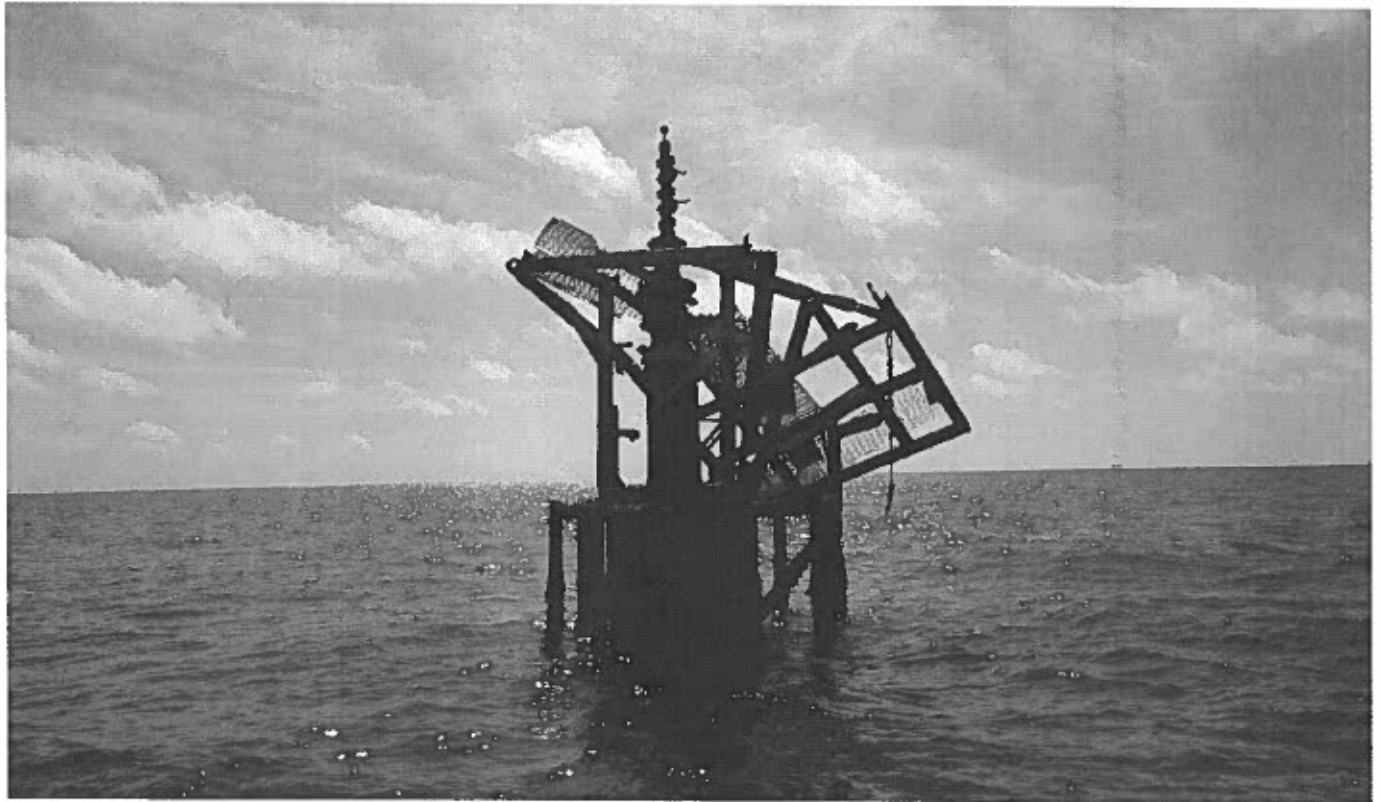
(Satellite and Production Equipment)