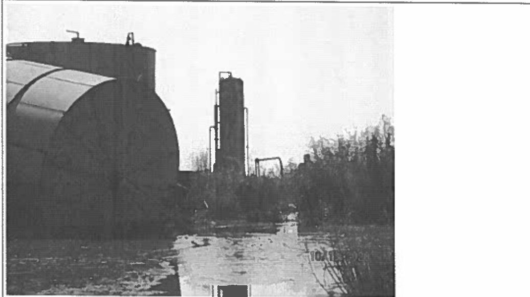
Tanks and production equipment