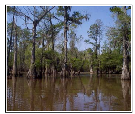
Water in the Atchafalaya Basin originates from one or more of the distributaries of the Atchafalaya River.

The Atchafalaya Basin in south-central Louisiana includes the largest contiguous river swamp in the United States and the largest contiguous wetlands in the Mississippi River Valley. The basin includes 10 distinct aquatic and terrestrial habitats ranging from large rivers to backwater swamps. The basin is most noted for its cypress-tupelo gum swamp habitat and its Cajun heritage.