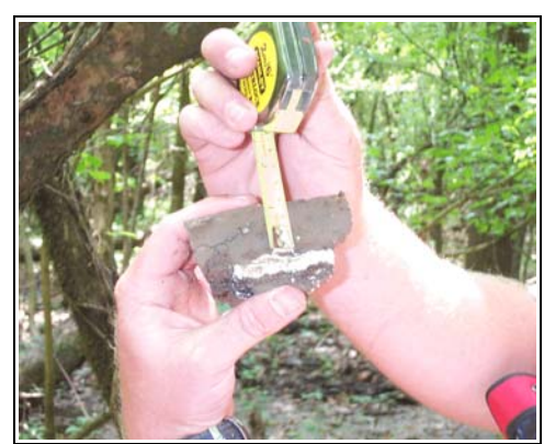
Measuring sediment deposited in a backswamp area after flood season.