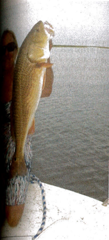
the redfish in a pond off