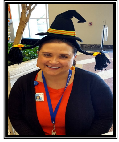
According to Barbara the Good Witch - DNR Employees are generous givers!