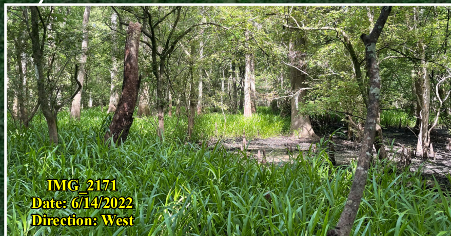
IMG_2171 Date: 6/14/2022 Direction: West