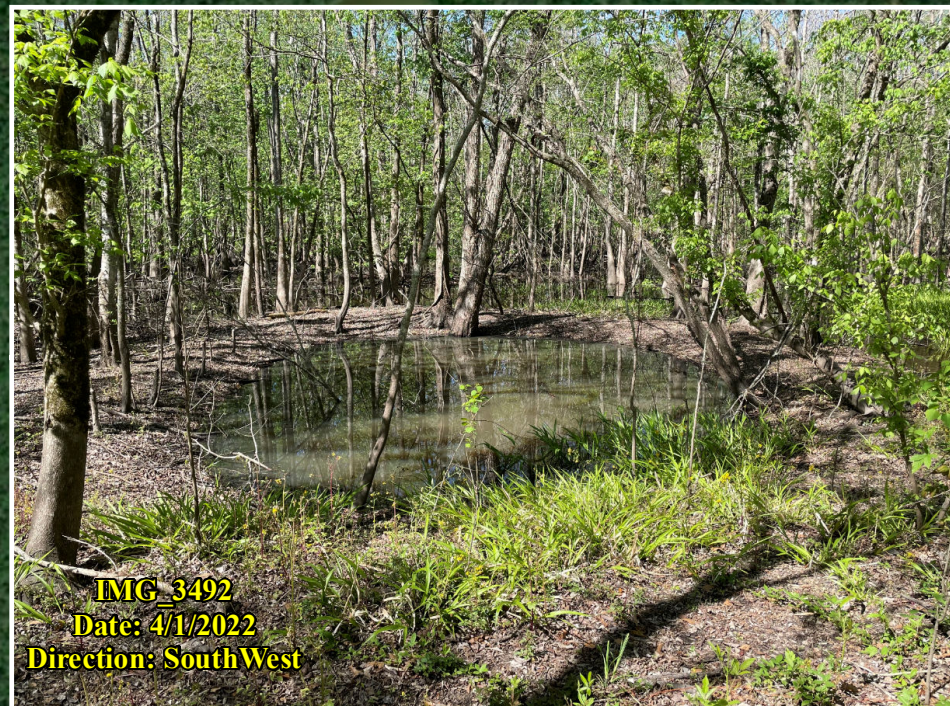
IMG_3492 Date: 4/1/2022 Direction: SouthWest