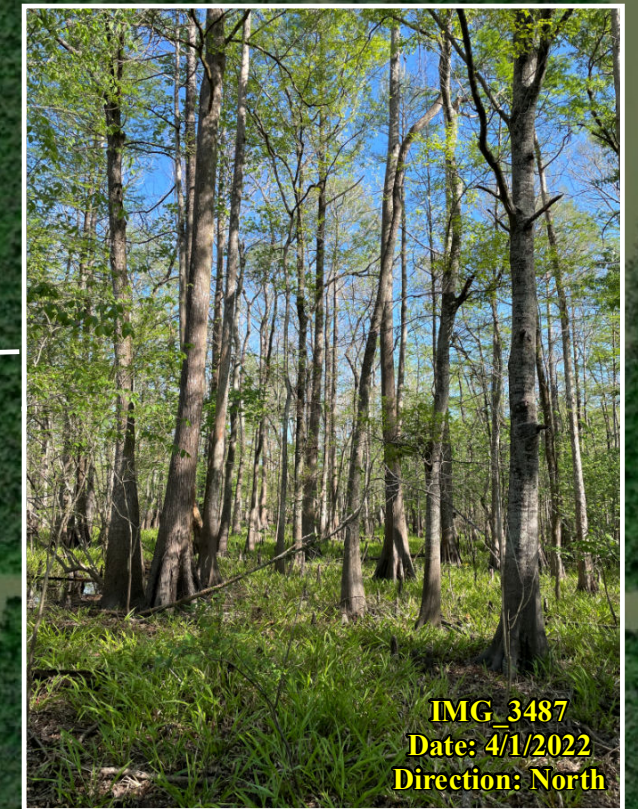
IMG_3487 Date: 4/1/2022 Direction: North