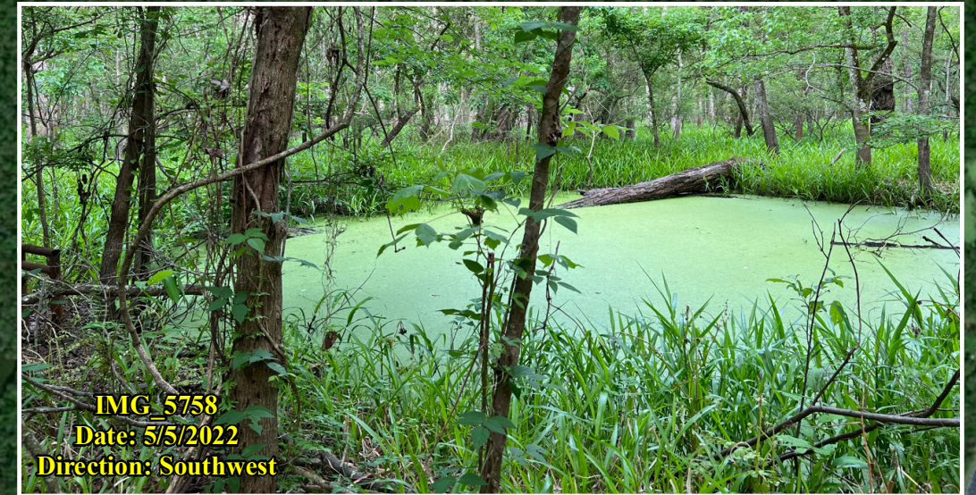
IMG_5758 Date: 5/5/2022 Direction: Southwest