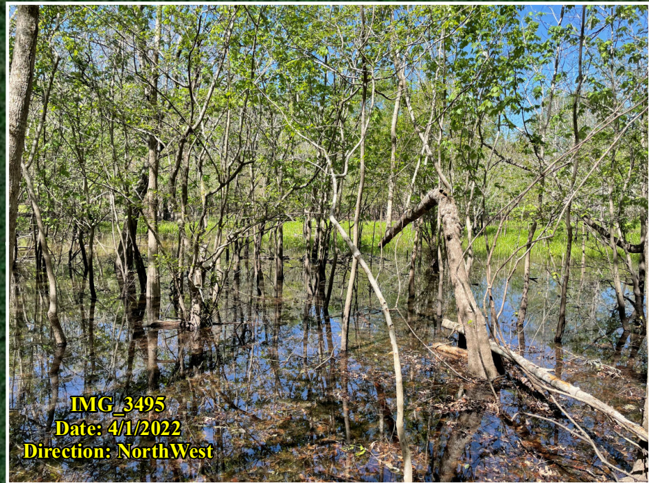
IMG_3495 Date: 4/1/2022 Direction: NorthWest