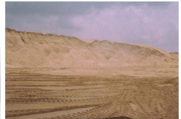
Dangerously steep embankment. ATV tracks indicate heavy visitation. (Ouachita Parish)