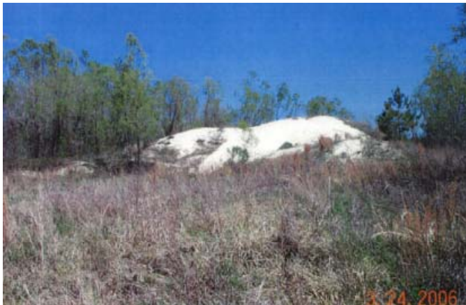
Partially vegetated spoil pile (East Feliciana Parish)