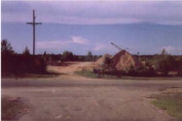
Abandoned dragline (Grant Parish)