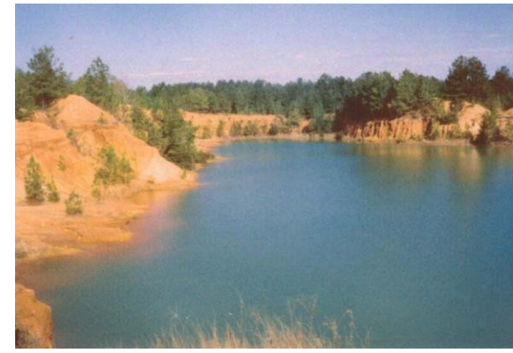
Highwall surrounding pit lake. A swimmer would have difficulty exiting. (Grant Parish)