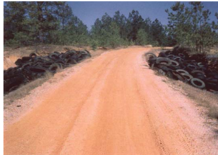
Discarded tires (Grant parish)