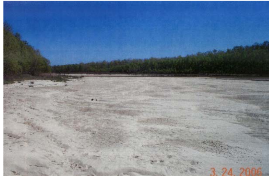
Clogged Stream (East Feliciana Parish)