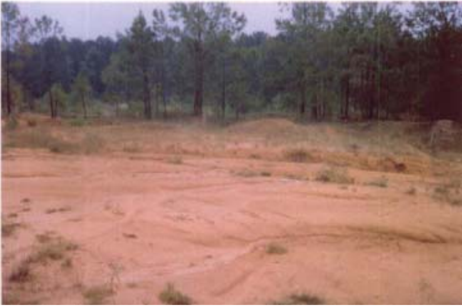
Unvegetated area. Note the heavy erosion. (Grant Parish)