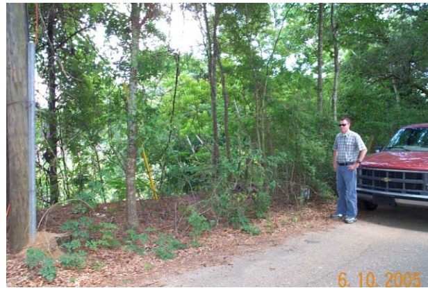
Top of 50-ft near-vertical highwall adjacent to a parish road (St Tammany Parish – AML Inspector at right)