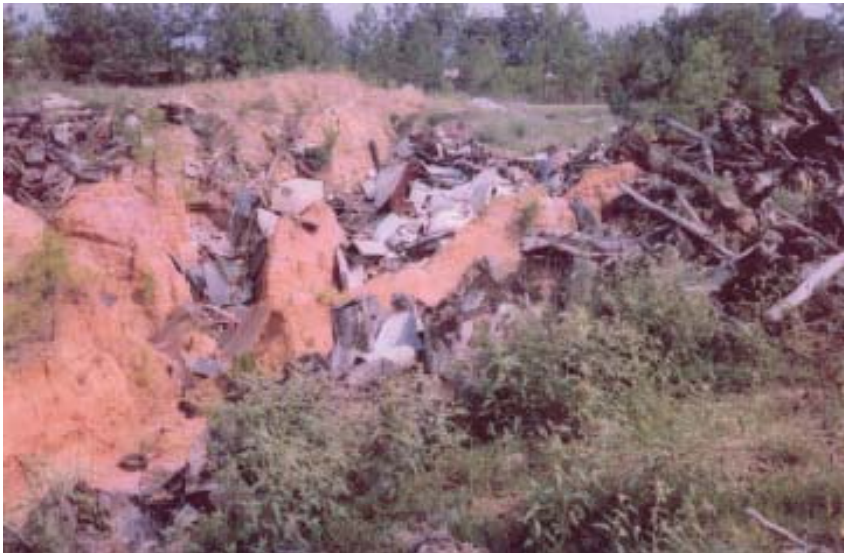
Wood waste and construction debris dumping in Grant Parish.