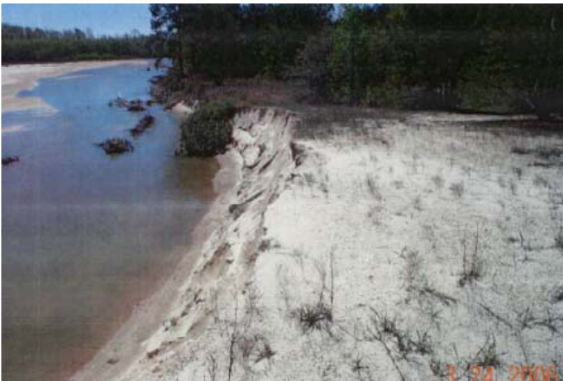
Clogged stream land (East Feliciana Parish)