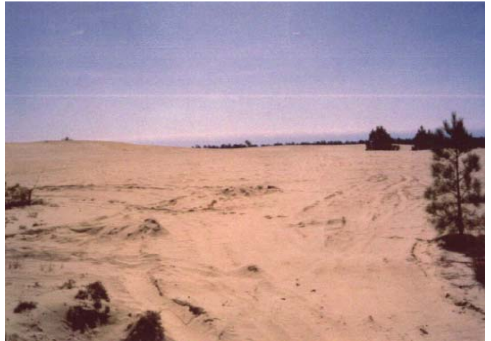
Unvegetated area (Grant parish).