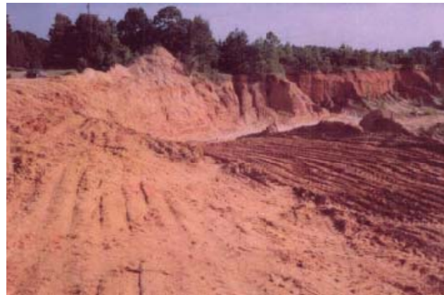
Vertical Highwall. ATV tracks indicate heavy visitation. (Grant Parish)