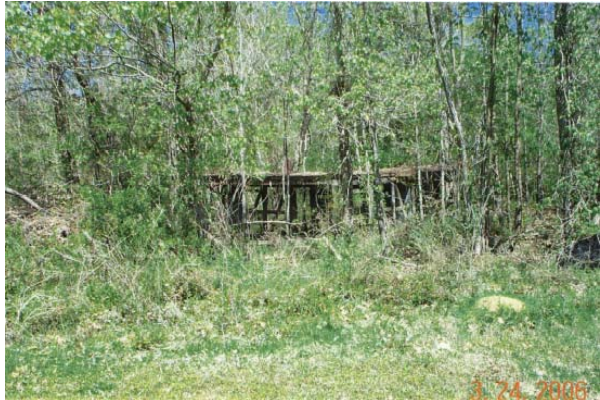
Dilapidated facility (East Feliciana Parish)