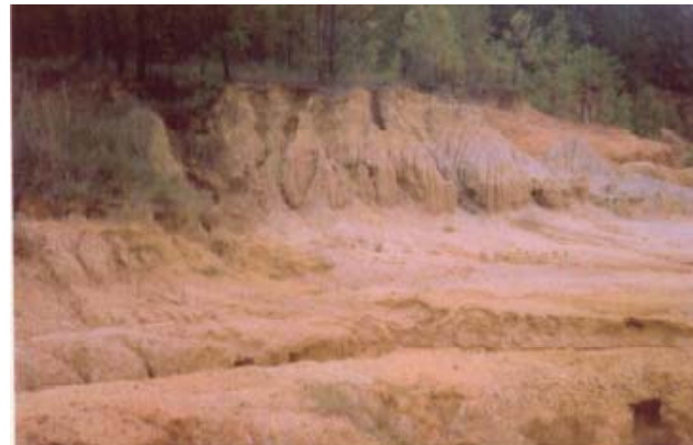
Highwall in Grant Parish.