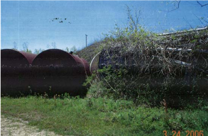
Abandoned fuel storage tanks and equipment (East Feliciana Parish)