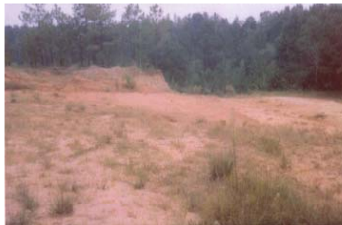
Steep embankment on the side of a spoil pile in background (Grant Parish)