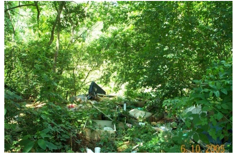
Household waste dumping (St. Tammany Parish)