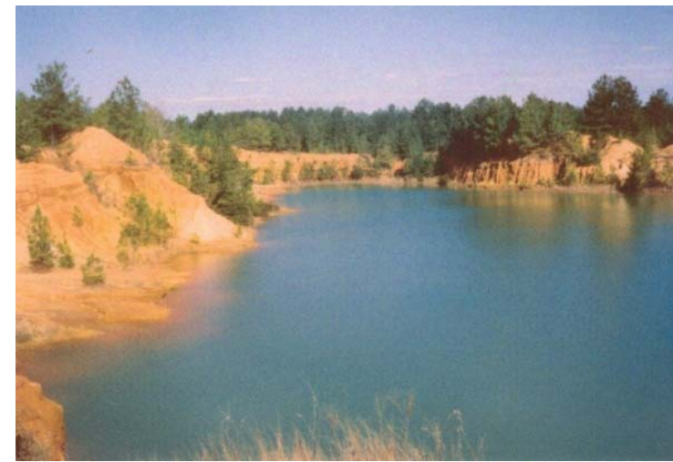
Highwall surrounding pit lake. A swimmer would have difficulty exiting. (Grant Parish)