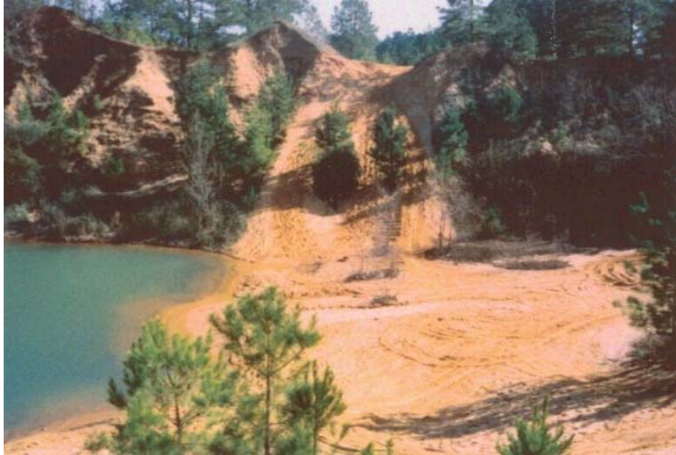
Highwall. ATV tracks indicate heavy visitation. (Grant Parish)