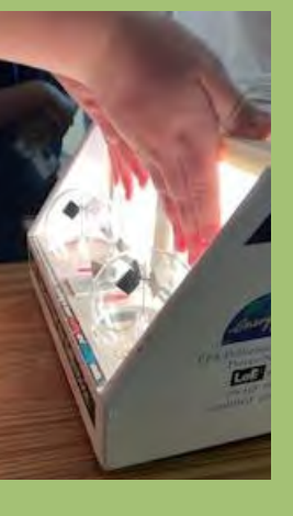
Appropriate for all ages! The energy office can customize this lesson for you. Younger students enjoy learning how to save energy at home and older students get hands on experience conducting an energy audit at the school!