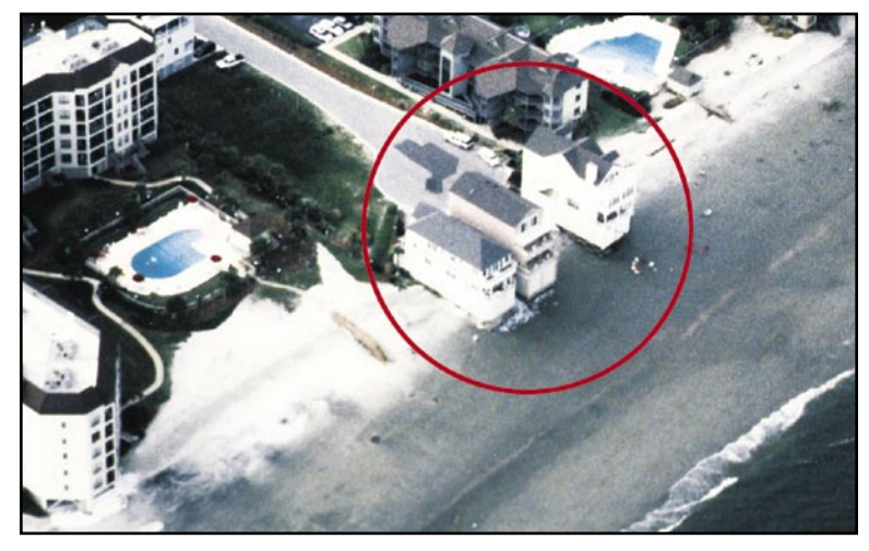
Figure 1. Well-built but poorly sited building.

A well-built but poorly sited building can be undermined and will not be a success (see Figure 1). Even if a building is set back or situated farther from the coastline, it will not perform well (i.e., will not be a success) if it is incapable of resisting high winds and other hazards that occur at the site (see Figure 2).