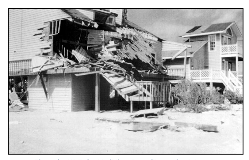
Figure 2. Well-sited building that still sustained damage.