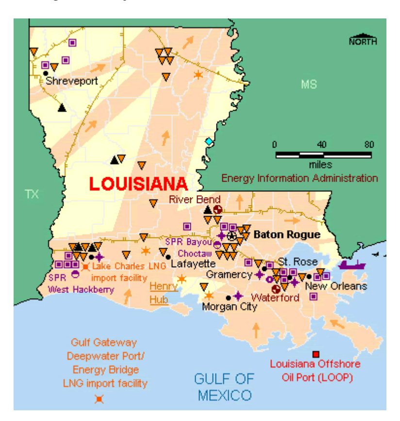
Figure 2. Major Electric Power Plants in Louisiana

Entergy has not decided to build a nuclear unit, but it is positioning itself to have the option to build a nuclear unit. Entergy Nuclear has signed a project development agreement with GE-Hitachi Nuclear to order reactor components and is on schedule to submit a combined construction and operating license application for its Grand Gulf nuclear site in Mississippi by the end of 2007 and a second application for its River Bend site in Louisiana in mid-2008.<sup>1</sup>