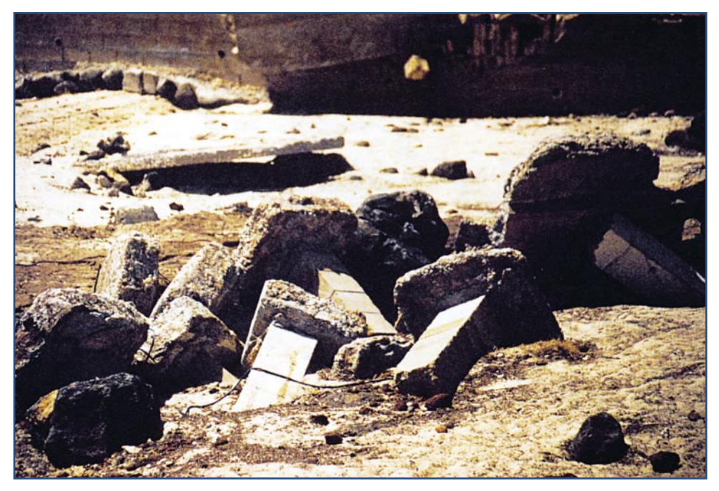
The small footings on the piers in this photograph did not prevent these piers from overturning during Hurricane Iniki.

The combination of high winds and moist (sometimes saltladen) air can have a damaging effect on masonry construction by forcing moisture into even the smallest of cracks or openings in the masonry joints. The entry of moisture into reinforced masonry construction can lead to corrosion of the reinforcement steel and subsequent cracking and spalling of the masonry. Moisture resistance is highly