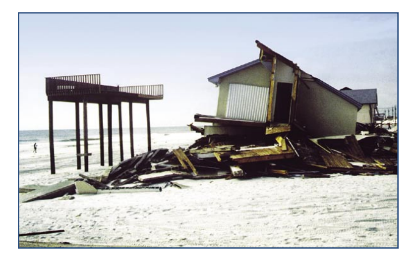
Damage from Hurricane Opal in Florida. This deck was designed to meet State of Florida Coastal Construction Control Line (CCCL) requirements. The house predated the CCCL and was not.