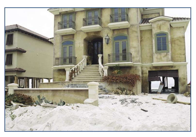
Large solid stairs such as these block flow under a building and are a violation of NFIP free-of-obstruction requirements.