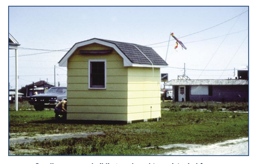
Small accessory building anchored to resist wind forces.

• When an accessory building is placed in a V zone, the design professional must determine the effect that debris from the accessory building will have on nearby buildings. If the accessory building is large enough that its failure could create damaging debris or divert flood flows, it must be elevated above the DFE.